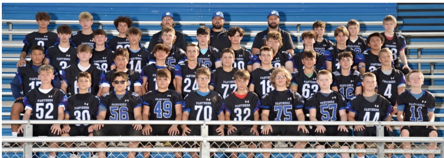
Modified Football Team