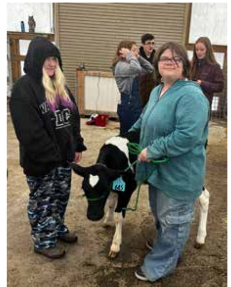
Upperclassmen enjoyed a field trip to Alfred State Farm for Veterinary, Agriculture, Sciences, and Technology Career Discovery Day in October 2024.

The event attracted more than 1,000 students from 40 school districts and was organized by Alfred State College's Agriculture and Veterinary departments. The day featured hands-on activities and events staged around the farm. ASC employees and students encouraged attendees to try surveying land, performing a livestock ultrasound, operating heaving equipment, and more.