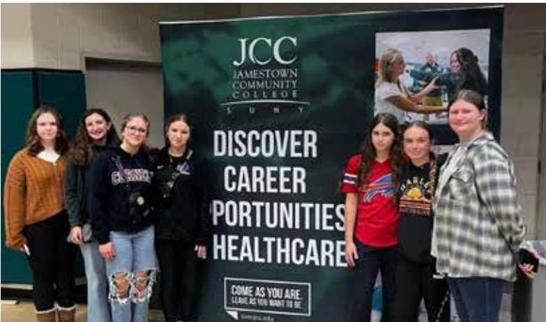
Students took a field trip to Jamestown Community College in October for Healthcare Career Exploration Day.

To kick things off and to get our juniors and seniors thinking seriously about their post-graduation plans, the district welcomed representatives from nearly two dozen higher learning institutions on Wednesday, September 25, 2024, for the annual College Consortium. All seniors and juniors were encouraged to explore their options and ask questions.