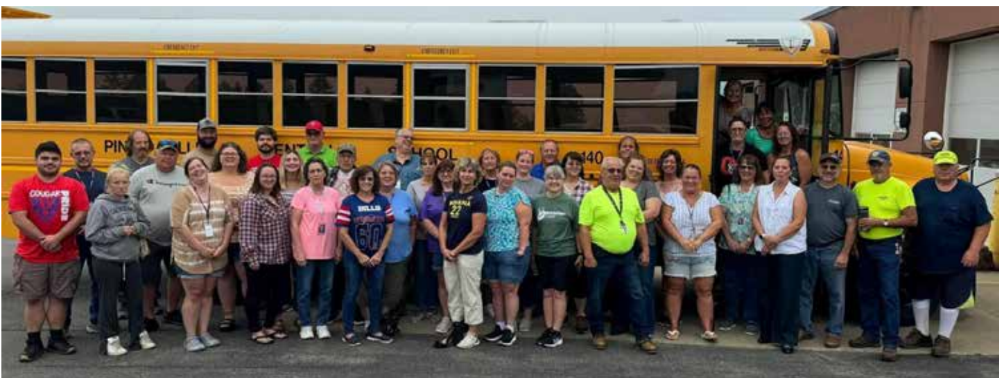
Bus drivers and attendants from Pine Valley and Cassadaga Valley united for a collaborative day of professional development prior to the start of the 2024-2025 academic year.