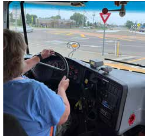
A bus driver navigates the roundabout at Route 20 and Route 5 in Fredonia.

The day of collaborative professional development concluded with the teams using their words to build the statement "How will I change the world today?" This was a focus for leadership teams at both PVCS and CVCS. The teams ended the scavenger hunt at the CVCS bus garage by enjoying a potluck lunch together.