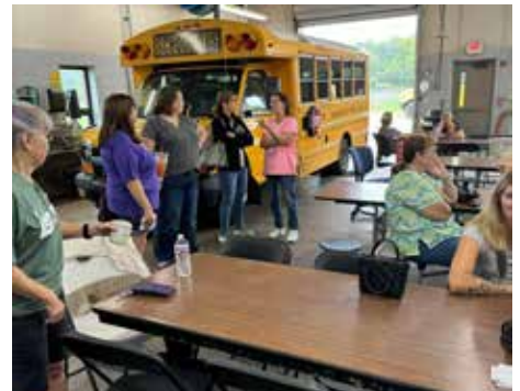
Transportation employees enjoyed a hearty breakfast before embarking on a work-related scavenger hunt.