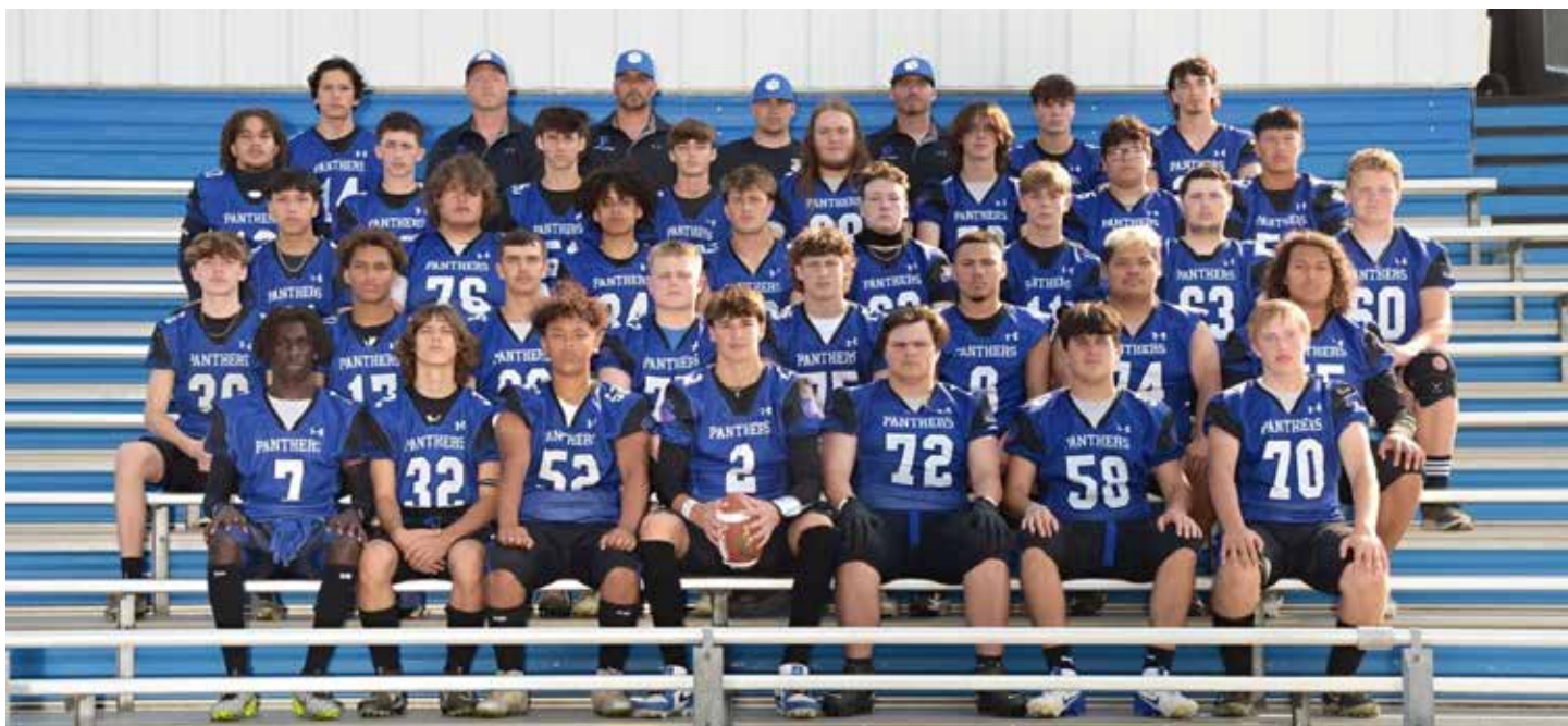
Varsity Football Team