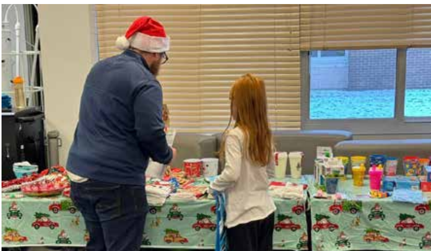
Photo of 2023 Santa's Secret Shop

The Parent Teacher Organization of Pine Valley Elementary School could use volunteers to plan and work the annual Santa's Secret Shop. Assistance is needed in organizing the event, setting it up with shopping "elves" to assist the children in selecting gifts. Volunteers can work the whole day or in 2-hour chunks, whatever they can offer. Those interested can please reach out to the PTO via Facebook or through email- pvcps.pto@gmail.com .