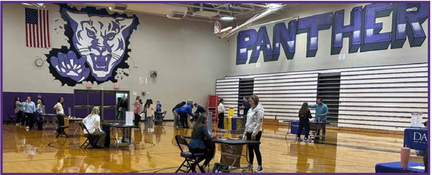
The annual College Consortium was attended by dozens of juniors and seniors at Pine Valley Jr./Sr. High in September.

The Counseling Department has facilitated a variety of field trips and experiences for students at Pine Valley Jr./Sr. High to kick off the 2024-2025 academic year.