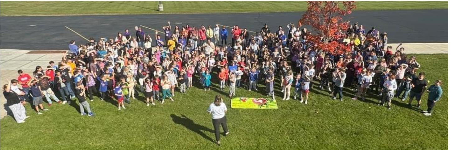
The entire elementary school took the Big Apple Crunch challenge in October on the front lawn of the campus.

Most recently, elementary students and staff united on the front lawn on Tuesday, October 22, 2024, to bite into locally grown apples in unison in celebration of New York State food and farms. The Big Apple Crunch initiative is observed annually in October and this is the second year our Panther family participated in collaboration with the New York State Education Department Child Nutrition Program.